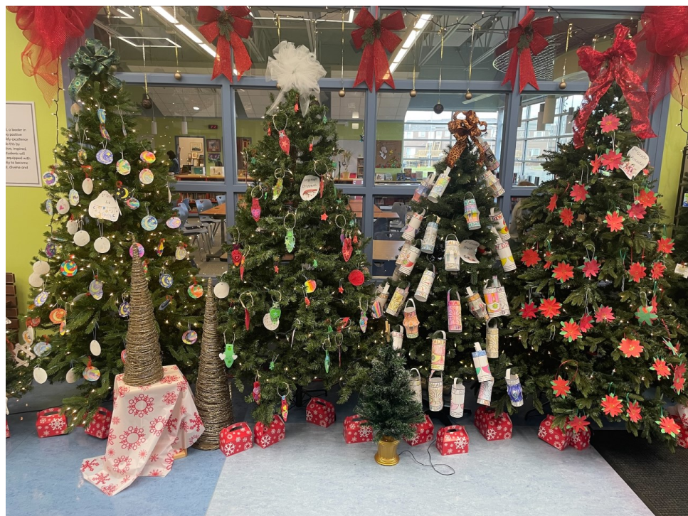
Pictured are the trees decorated for holidays around the world. We can’t wait to decorate them by celebrating our families!